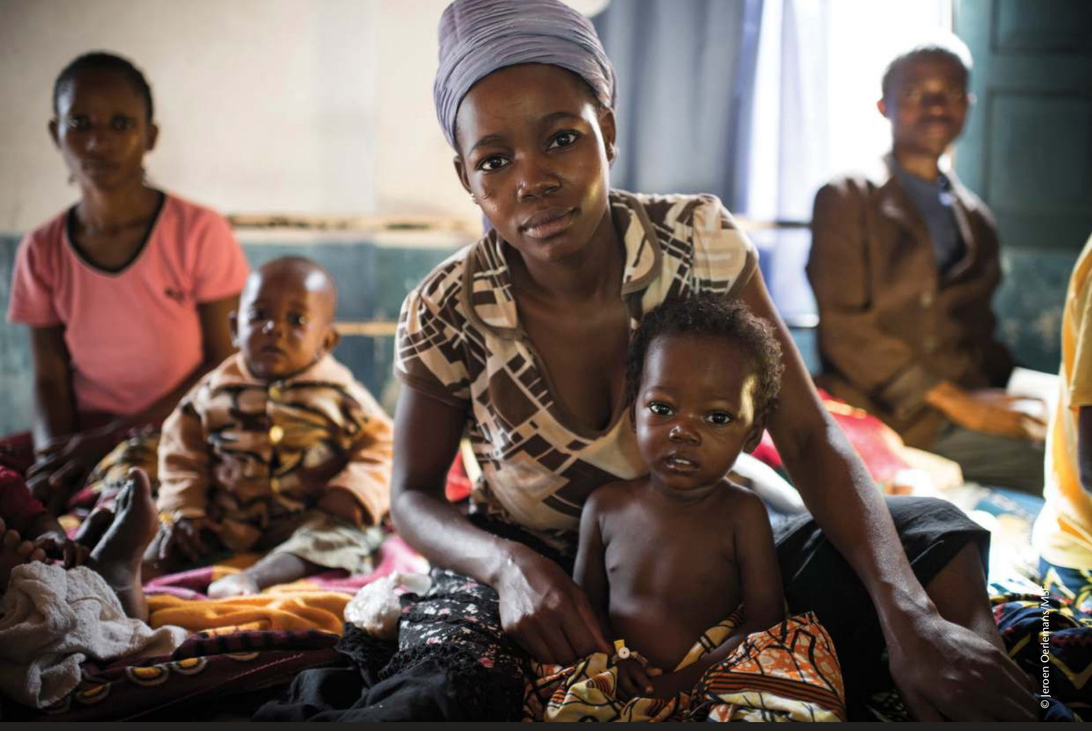
On the paediatric ward of Baraka hospital, South Kivu, Democratic Republic of Congo.