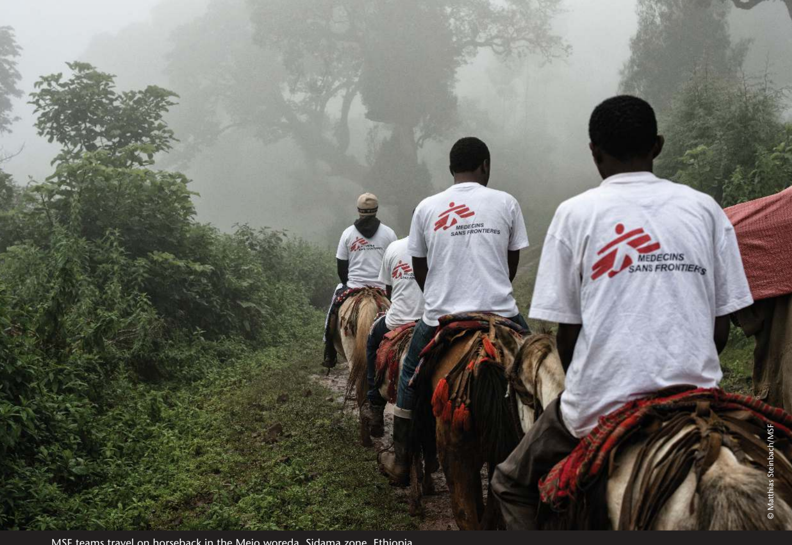
MSF teams travel on horseback in the Mejo woreda, Sidama zone, Ethiopia.